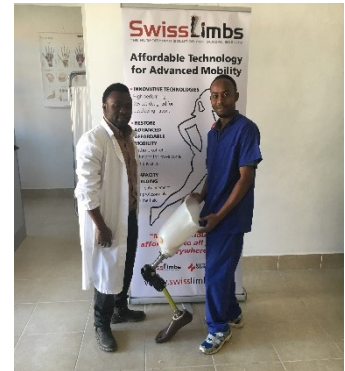
Ikonda Hospital team Orthopedic Workshop Njombe