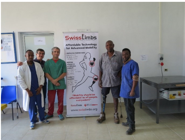
Tanzania – Ikonda Hospital