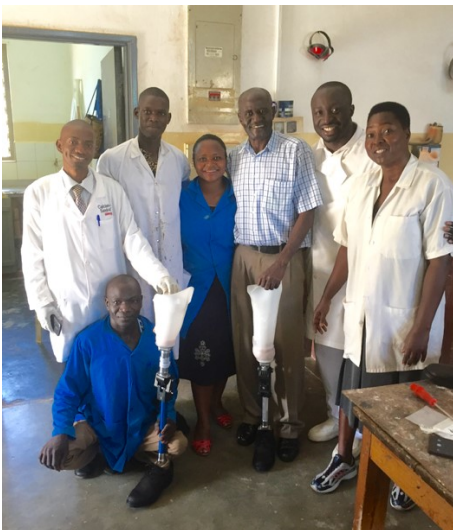
The Gulu Regional Referral Hospital – Orthopedic Workshop Team