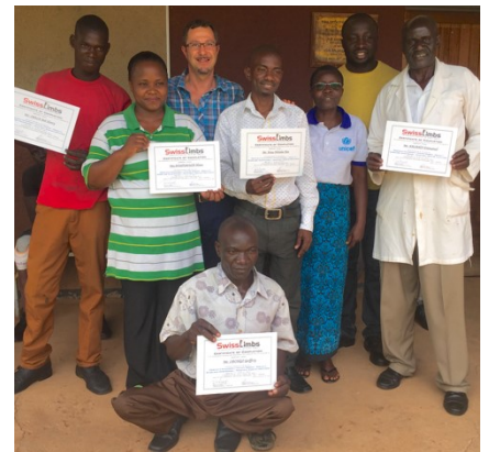
5 technicians received their Certificate of participation for the training course Module II , which included the Above Knee Technology and the Modular SwissLimbs Technology.