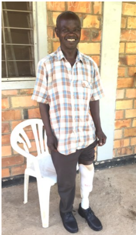
Alterno Nokrach 55 Left Below Knee with Monolimb™ Technology