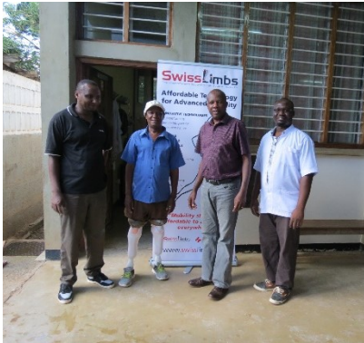
TATCOT team with patient Orthopedic Workshop Moshi