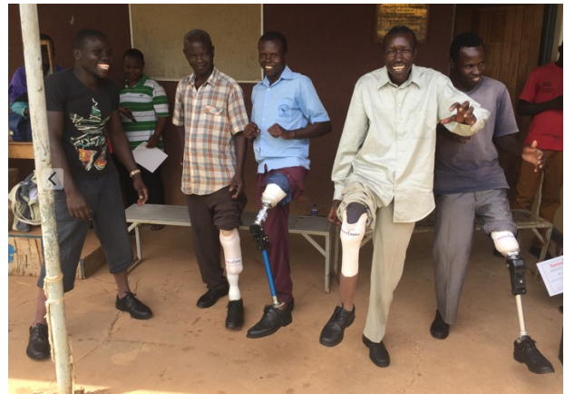
Uganda – Gulu Referral Hospital